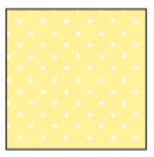
5727-44 Yellow Dot