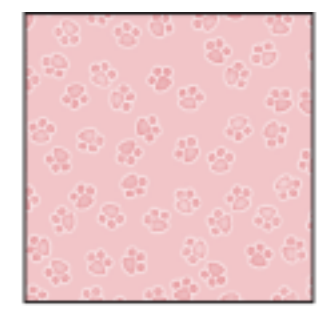
5728-22 Pink Paw Print