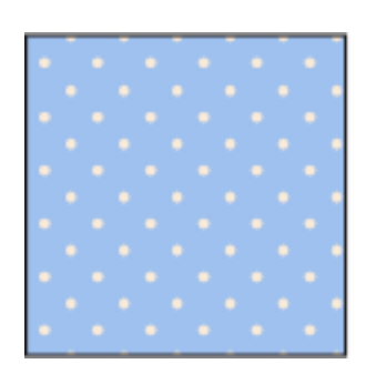
5727-11 Blue Dot