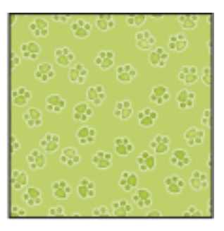
5728-66 Green Paw Print