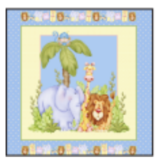
5723-11 Blue Printed Panel