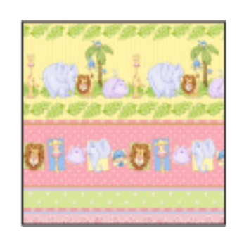
5724-22 Pink Printed Stripe