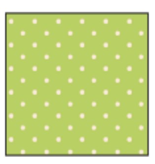
5727-66 Green Dot