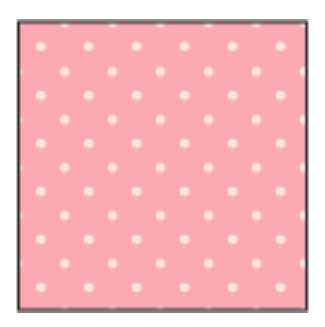
5727-22 Pink Dot