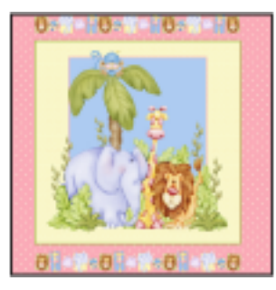
5723-22 Pink Printed Panel