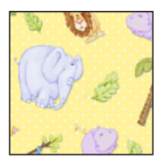
5725-44 Yellow Animals