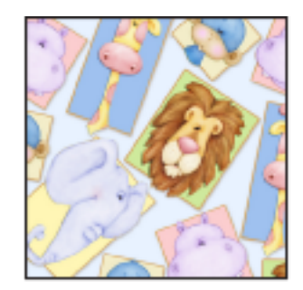
5726-11 Blue Animal Portraits