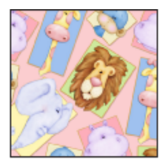
5726-22 Pink Animal Portraits