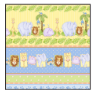
5724-11 Blue Printed Stripe