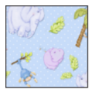
5725-11 Blue Animals